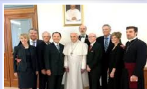
Protestant leaders meeting with Pope Francis in July 2014

9) What experience does the Bible say God's prophets will have while they are in vision? -Numbers 24:4.